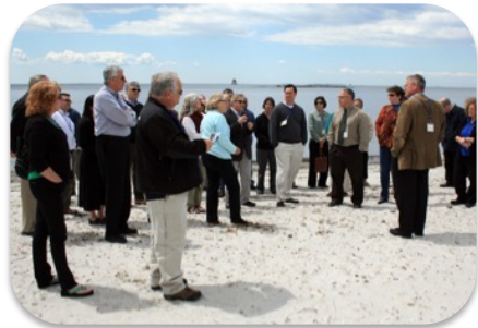
Land Use & Climate Resiliency