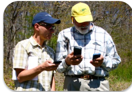
Geospatial Tools & Training