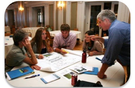
STEM Education & Local Conservation